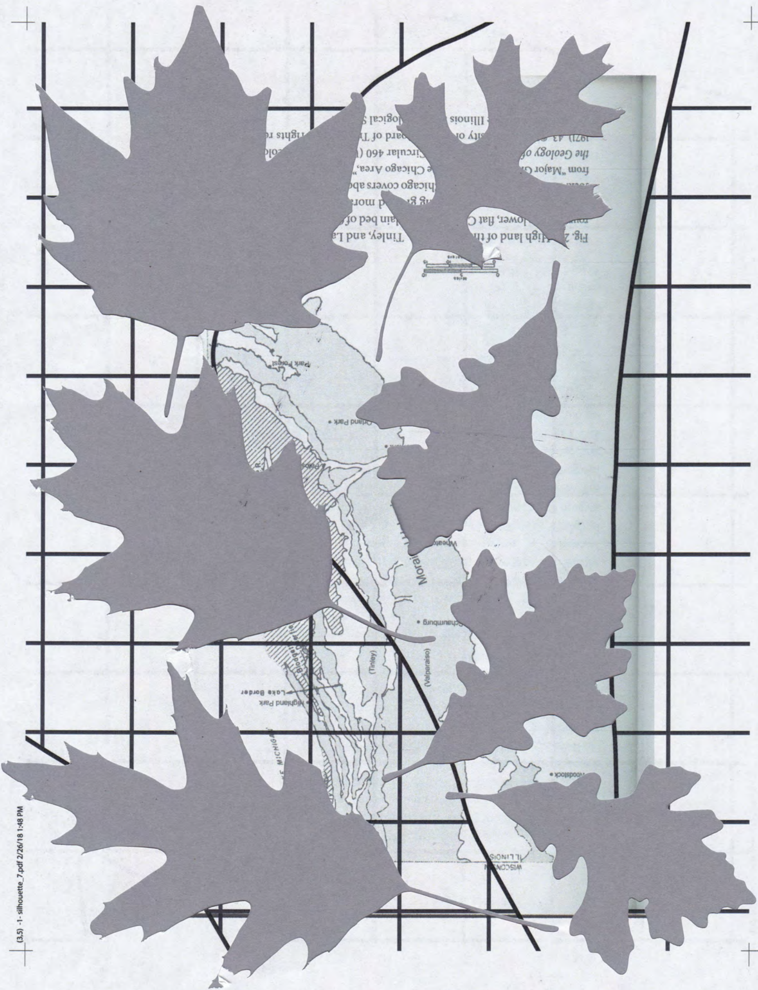
Fig. 2. High land of the lower, flat C Chicago covers abo Chicago Area, Circular 460 (1 Board of Tr Illinois rights re